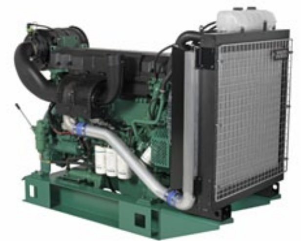
ELECTRICAL POWER GENERATION