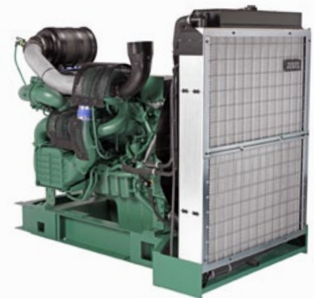
16 LITRE SERIES

This document is not contractual. In a constant effort to improve the quality of its products, Volvo Penta reserves the right to modify any of the characteristics stated in this form without notice. For specific information on a certain engine model, please ask your dealer or visit our website www.volvopenta.com . All models are not available on all markets. The engines in the pictures may be fitted with extra optional equipment.