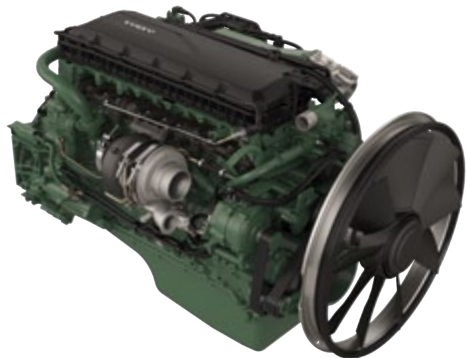
OFF-ROAD AND STATIONARY